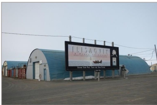
Outdated buildings such as these Cold War-era Quonset huts at Iłisaǵvik College (Barrow, AK) are common at many TCUs.